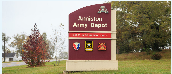
Anniston Army Depot is the home of Anniston Munitions Center, Defense Logistics Agency, and the Department of Defense's Center of Industrial and Technical Excellence