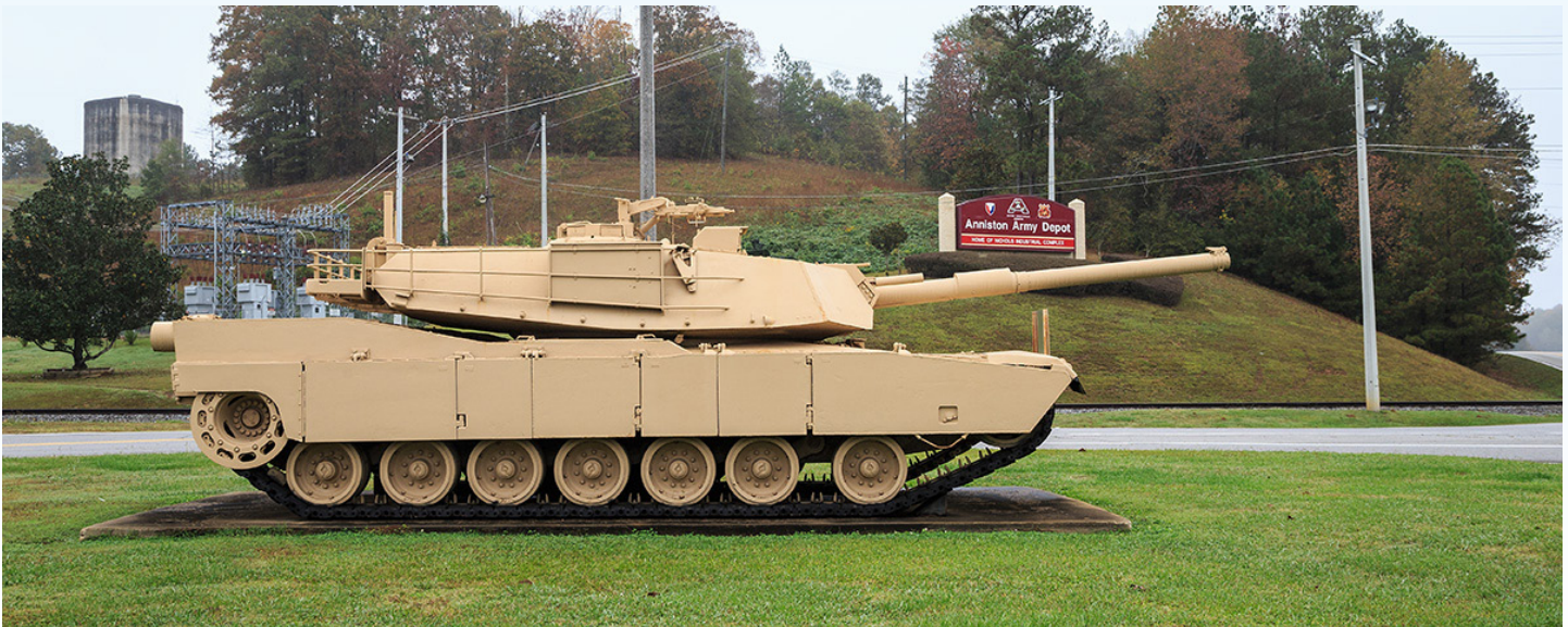
Anniston Army Depot, Alabama, home of the Center of Industrial and Technical Excellence

Alabama Power provides the valuable combination of competitive prices, reliable electricity supply and unparalleled service to more than 1.4 million homes, businesses and industries in the southern two-thirds of Alabama. It is one of four U.S. utilities operated by Southern Company (NYSE:SO) and one of the nation's largest producers of electricity. Learn more at www.alabamapower.com .