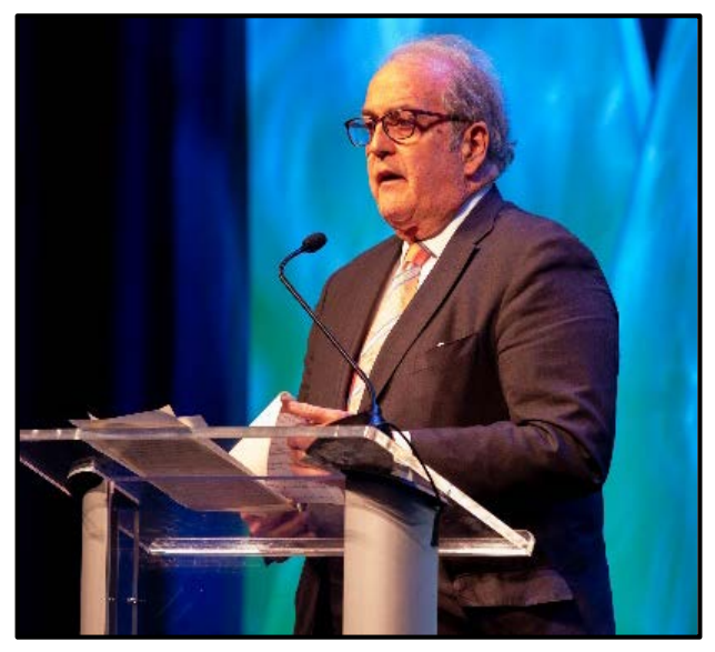
Hon. Alex Beehler, highlights the impact of energy resilience on Army readiness at the opening session for the Energy Exchange – 2019.

Mr. Surash also spoke at the Army Energy Manager Training Workshop held in conjunction with the Energy Exchange. He said, "Enabling warfighter readiness begins on our installations. Modernizing installation energy and water programs, technology and infrastructure will increase the U.S. Army's ability to project multi-domain operations. Through diligent energy management, our installations can become robust and resilient power projection platforms." He also provided a framework of 'top ten' resilience and efficiency strategies for installations: (1) energy resilience training exercises, (2) onsite energy generation, (3) issuing mock electric bills to installation tenants to motivate energy efficiency and cost-saving measures, (4) lowering lifecycle costs, (5) building control systems, (6) reducing demand, (7) guaranteed energy savings, (8) use of native landscapes, (9) single stream recycling and (10) reducing waste.